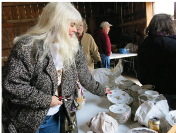
May 20 th Rummage Sale at the Corner of the Past. Customer purchasing a lovely set of Haviland china for her new home. This was the first time that the SBHS took part in the annual Village of Sister Bay sale.