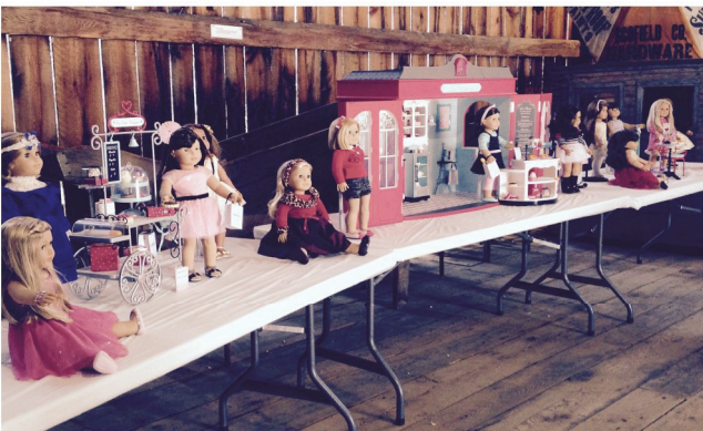
A view of the American Girl Dolls on display at the Show