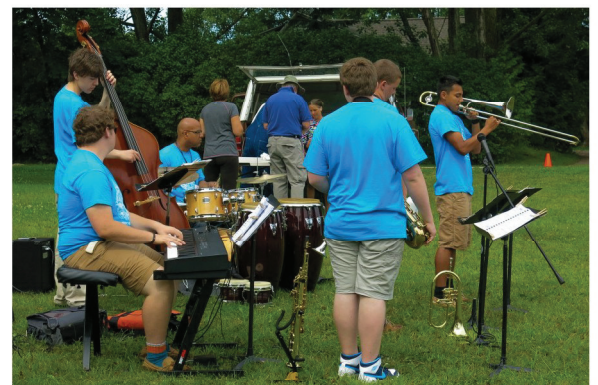
Birch Creek Jazz Ambassadors at Farmers Market