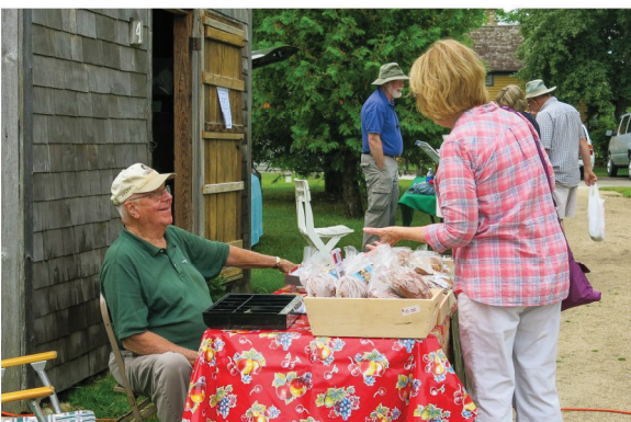
Ken Issel selling apple cider doughnuts