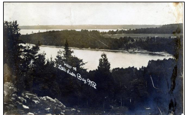
Another aerial view, turn of the century.