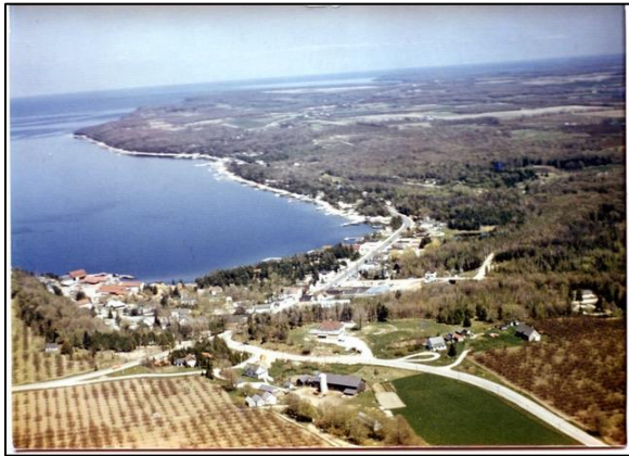
Aerial view of Sister Bay, Ca 1958

These pictures and many more are preserved in our two Centennial Books that are still available at the Sister Bay Historical Society. The Golden Jubilee 1912 – 1962 $5.00. Sister Bay Centennial 1912-2012 $15.00. Order on line, at sisterbayhistoricalsociety.org