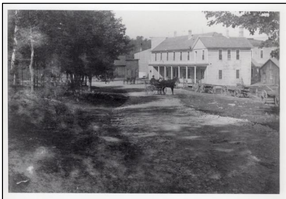
Sister Bay Hotel, before 1912 fire.