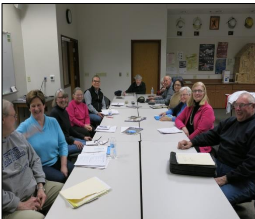
2019 SBHS Board Members meeting at The Sister Bay Fire Station