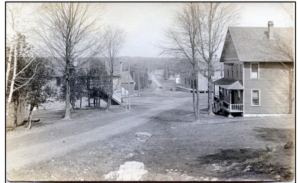
The Casper Nys home survived the fire of 1912. This is looking down the hill to the Main Street four corners.