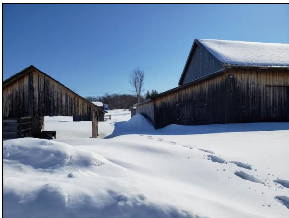
Tom's picture of last winter at the COTP