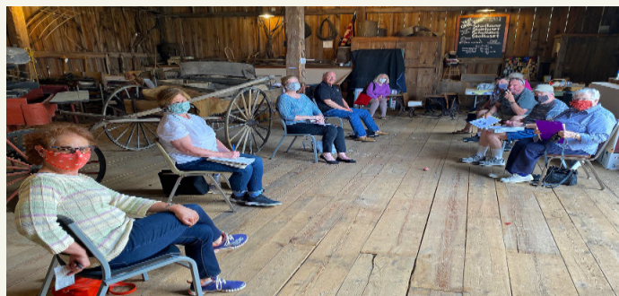
June, 2020 SBHS Board of Directors Meeting in the Koessl Barn.