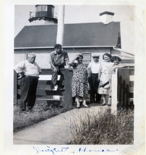
Share your old photos with us.